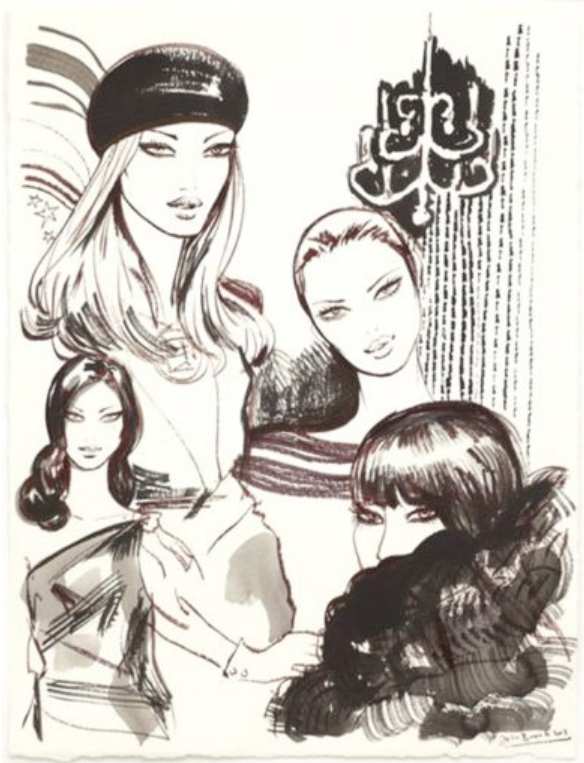
Jason Brooks Les Parisiennes 2007 Ink on paper 38 x 28.5 cm 01323