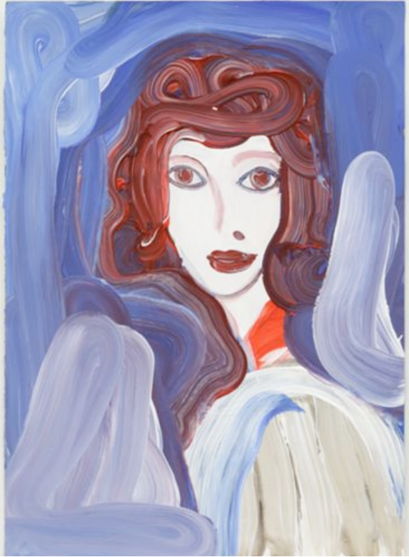
Tanya Ling Untitled June 2009 Acrylic paint on paper 42 x 29.5 cm 01425