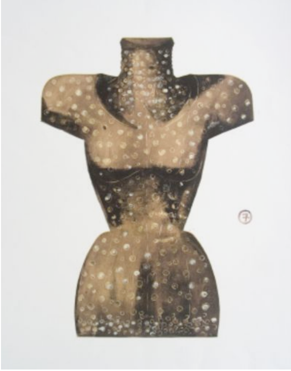
Francois Berthoud Bust / Alexander McQueen 1997 Oil based ink on paper 70 x 50 cm 01057