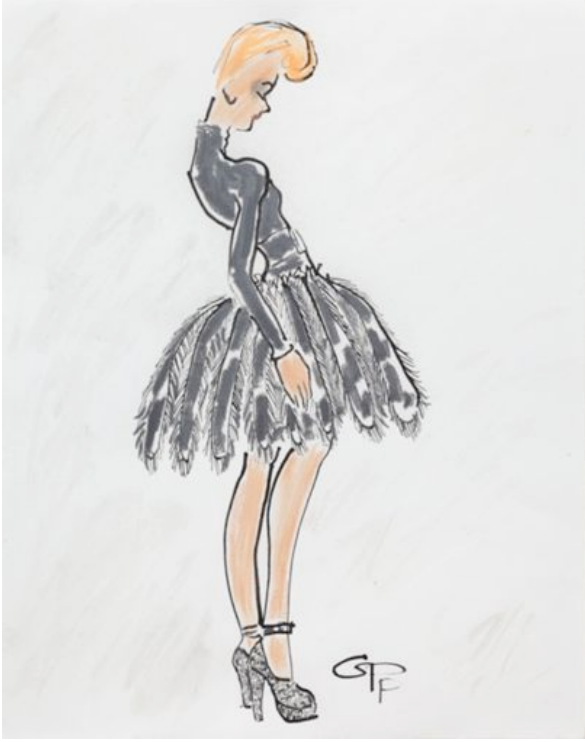
Gladys Perint Palmer Azzedine Alaia, July 8 2009 7 Rue de Moussy 2009 Pastel, glitter, paint and ink on paper 61 x 48.5 cm 01311